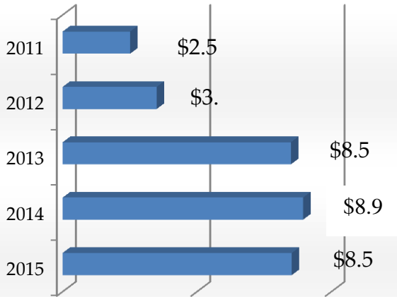
Value of New Single-Family Residential Permits (In millions of $)