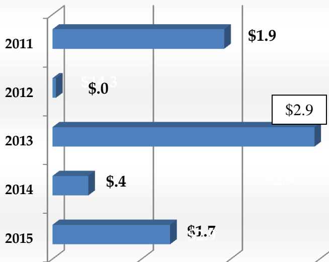
Value of New Comm.- Indus. Const. (In millions of $)