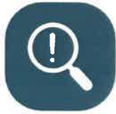
Issues & Opportunities