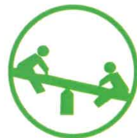
Park and Recreation Plan