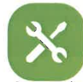
Community Facilities & Utilities