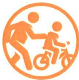
Bike and Pedestrian Plan