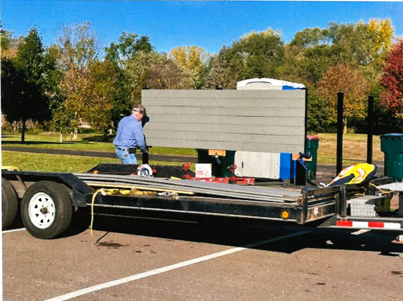
Irv Peskar, Parks Lead constructing the porta potty and garbage cart surround.

The porta potty and garbage surround at DeSanctis Park was installed on October 11, 2023. Service access to the porta potty and garbage carts will be available from the west side of the surround. Park goers will be able to see and access the porta potty and garbage from the trail or it can be accessed by walking through the parking lot around the side of the surround like service companies would.